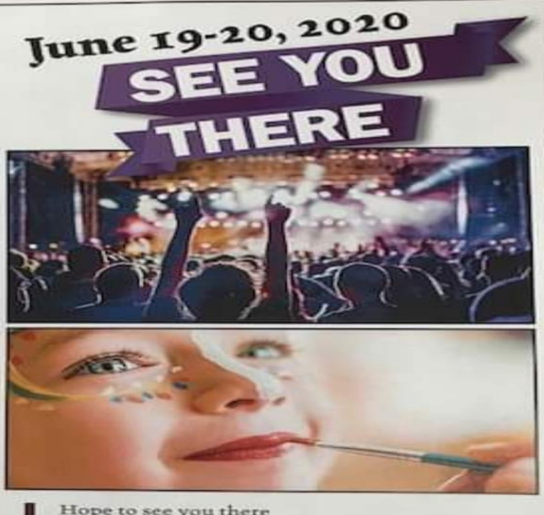
Hope to see you there Follow us on Facebook Town of Vauxhall and BRID Centennial

Town of Vauxhall and Bow River Irrigation District vauxhallcentennial.org