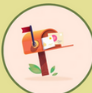
UPS & PUROLATOR SHIPPING PROGRAMS