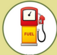
ESSO & PETRO-CANADA FUEL DISCOUNTS