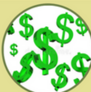
ADP & PAYWORKS

The following benefits can be used by you and your employees. Chambers