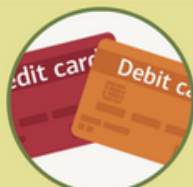
FIRST DATA CANADA