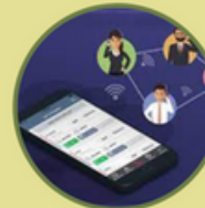
PRAGMATIC, ACCUTEL & VOLVE CONFERENCING