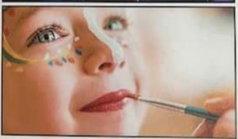
Hope to see you there Follow us on Facebook Town of Vauxhall and BRID Centennial