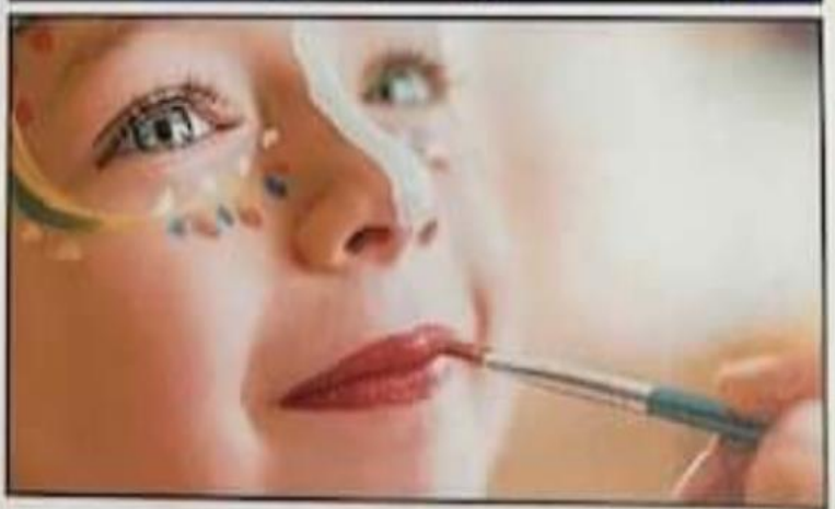
Hope to see you there Follow us on Facebook Town of Vauxhall and BRID Centennial