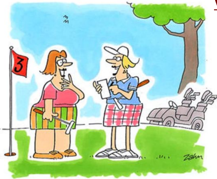
📷 We've only played three holes and we've both already shot our ages!"

We are going to try and do a legion Scramble at the vauxhall golf course June 25th! Once we finalize some information we will put out a post with more information!! Cheers!